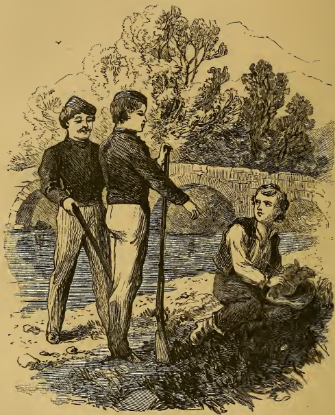
THE CHARMED MONEY.